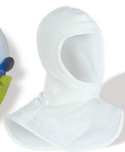
NK 2310 CA NOMEX® Hood