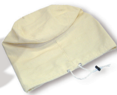
CF 3236 Faceshield