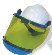
4692 Faceshield Assembly