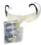
Safety Glasses and Ear Plugs