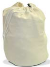
CF 3236 A Hood/Lens Bag