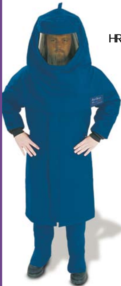
AGW40H Hood AGW40C-50 50" Coat AGW40L 19" Leggings